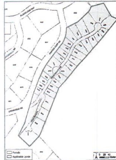
Map 1 showing lands where the revised RS3 Zone is proposed to be applied